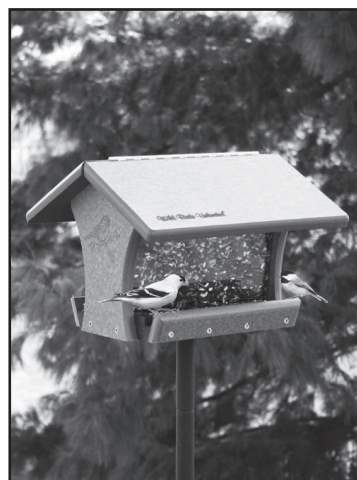
EcoTough Classic hopper feeder with WBU Deluxe Blend

Our WBU Deluxe Blend is full of sunflower seeds, millet and other seeds. Sunflower lovers will eat at the feeder, and ground-feeding birds will eat the fallen millet.